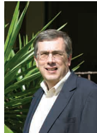
Executive Director Robert J. Kleberg, Jr. Endowed Chair